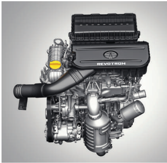
1.2L REVOTRON BS6 PH2 ENGINE