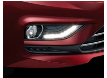
FRONT FOG LAMPS WITH CHROME RING SURROUNDS