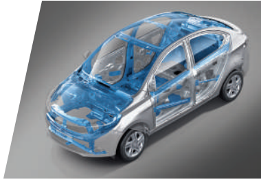
ENERGY ABSORBING STRUCTURE