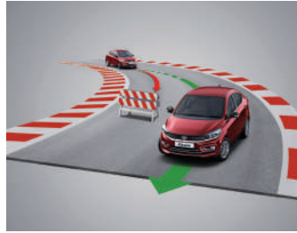
ABS WITH EBD AND CORNER STABILITY CONTROL