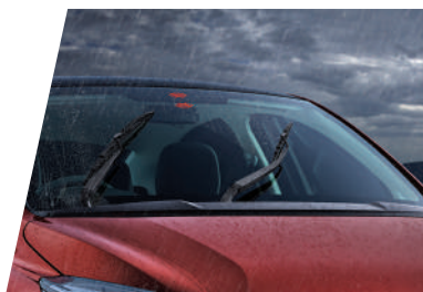
RAIN SENSING WIPERS