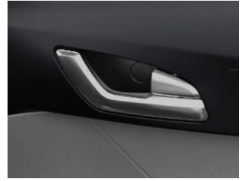
FRONT & REAR CHROME DOOR HANDLES