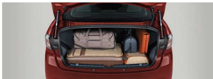
419L BOOT SPACE