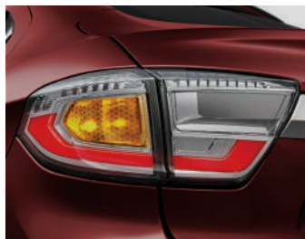
BOLD & BRIGHT LED TAIL LAMPS