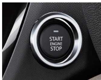
ENGINE START/STOP PUSH BUTTON