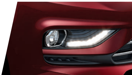
STRIKING LED DRLs