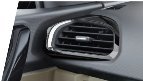
CHROME LINED SIDE AIRVENTS