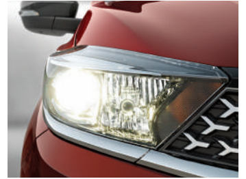
AUTOMATIC HEADLAMPS CONTROL