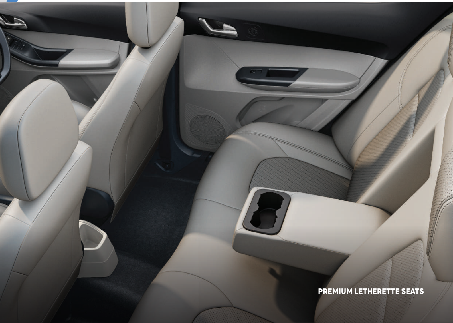
PREMIUM LETHERETTE SEATS