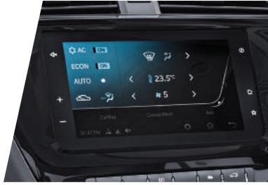
FULLY AUTOMATIC CLIMATE CONTROL