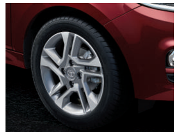
R15 SONIC SILVER ALLOY WHEELS