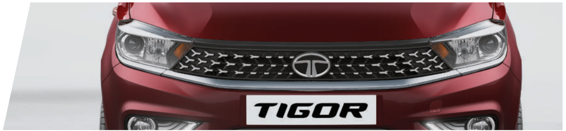
STYLISH CHROMED TRI-ARROW FRONT GRILLE