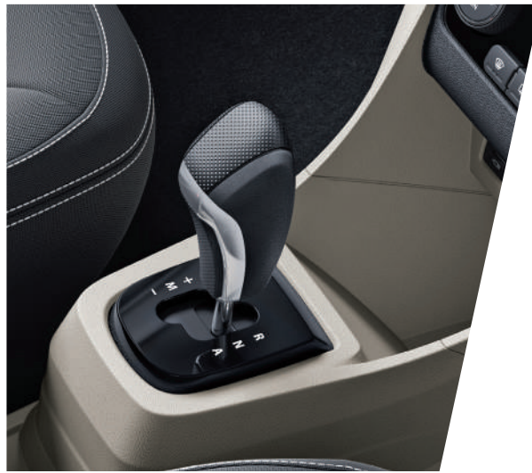
ADVANCE AMT TRANSMISSION