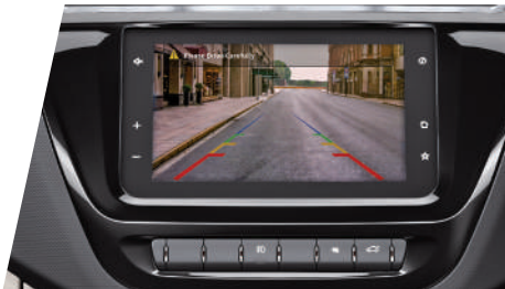
REAR PARKING ASSIST WITH CAMERA