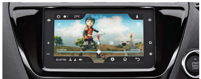
IMAGE & VIDEO PLAYBACK