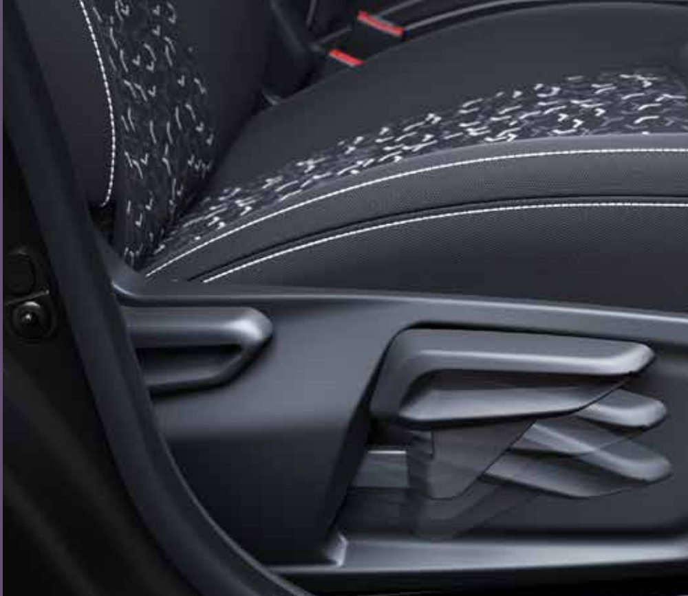
Height Adjustable Driver Seat