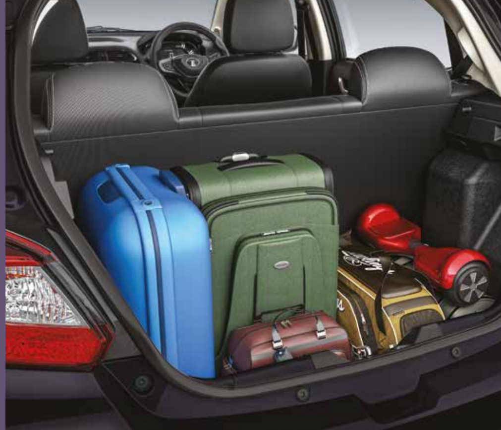
242 l Boot Space