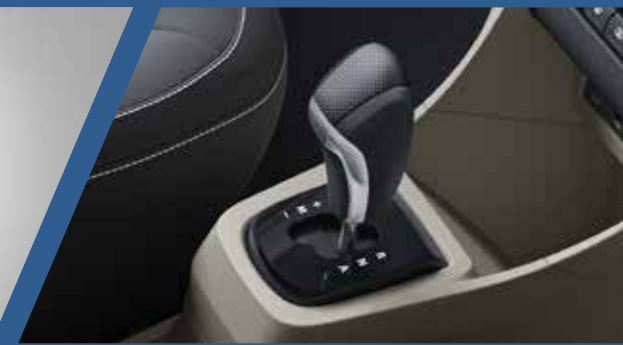
Advance AMT Transmission