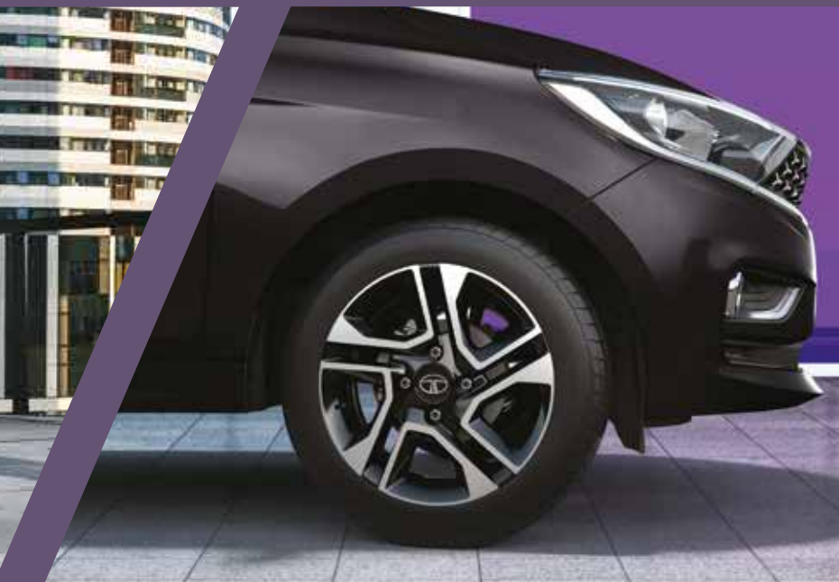
Trendy Dual Tone Alloy Wheels