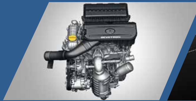
Max Power-86 ps @ 6000 r/min

Who says a peppy drive can't be thrilling? The Advanced AMT Transmission of Tiago lets you zip through any road without shifting a gear. The 1.2 L Revotron BS6 Ph2 petrol engine with the power of 86 ps @ 6000 r/min gives you an all-round performance.