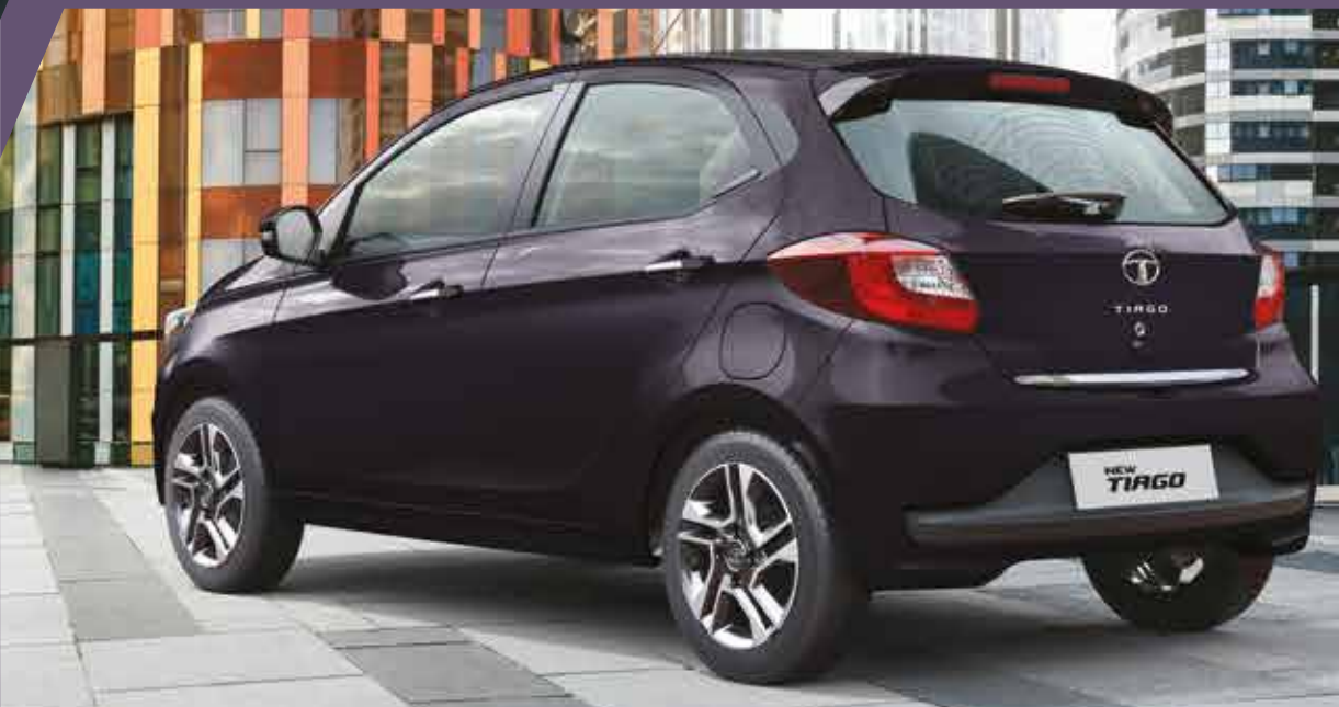
Chrome garnish on Tail Gate and Door Handles